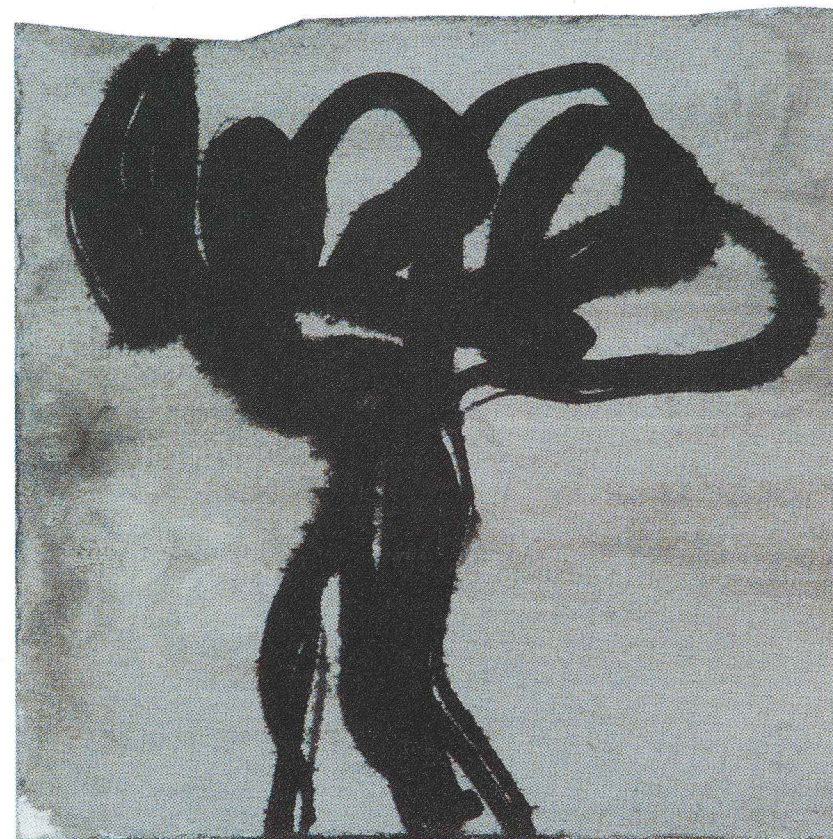
1996, Untitled (Flower), Coffee and ink on paper, 3 3/4 x 3 3/4 in.