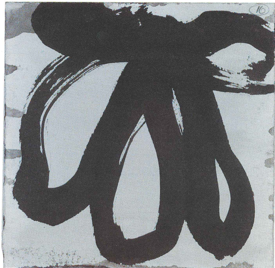
1996, Untitled (Flower), Coffee and ink on paper, 7 1/2 x 7 1/2 in.