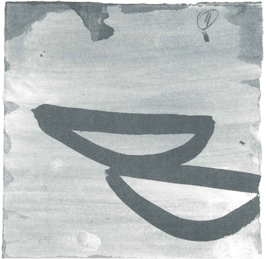
1996, Untitled (Two Boats), Coffee and ink on paper, 7 3/4 x 7 3/4 in.