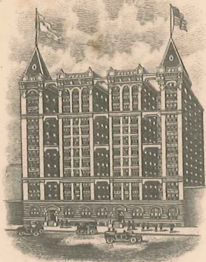
GREAT NORTHERN HOTEL 109-121 W. 56 TH STREET MAIN ENTRANCE 118 W. 57 TH STREET NEW YORK