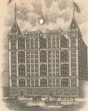
GREAT NORTHERN HOTEL 109-121 W. 56 TH STREET MAIN ENTRANCE 118 W. 57 TH STREET NEW YORK